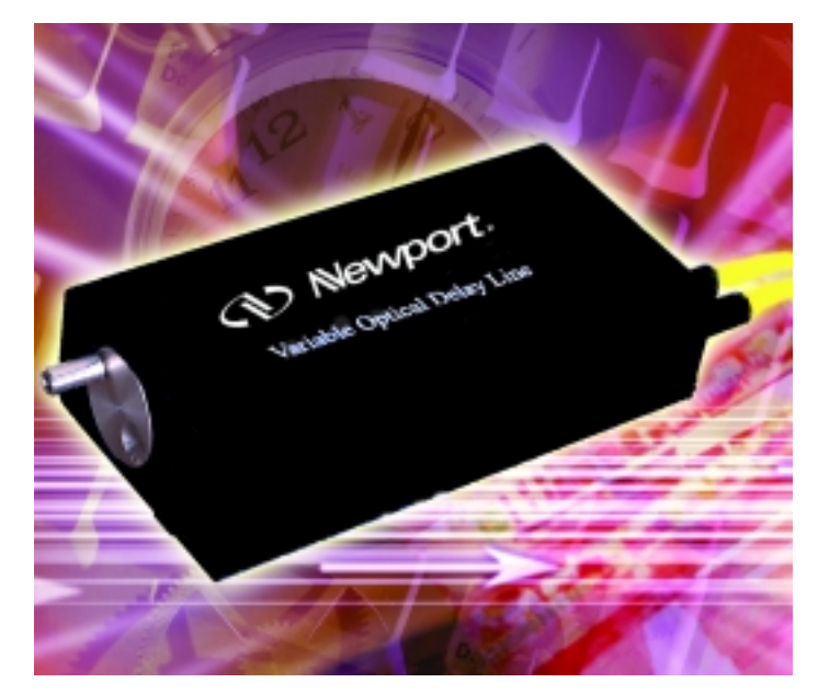
Figure 1. Newport Corporation' manually variable optical delay line— F-VDL. In this picture, a manual dial (shining metallic color) is shown at the left end and input/output fibers are at right end of the delay block. The delay length ruler is on the backside and is not shown in the picture.

Newport Corporation also has a motorized variable optical delay line, which can be easily controlled with high precision by front panel or computer commands. Please contact Newport Corporation for details.