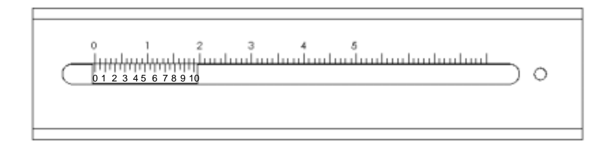
Figure 3. Delay length change ruler for the F-VDL device. The marked unit in the stationary scale is in centimeters with millimeter subdivisions.

The sliding scale is a differential type: the stationary scale has 1.00 mm divisions and the moving scale has 0.95 mm divisions. The resolution is 0.05 mm in moving distance reading (0.1 mm round-trip) which corresponding to 0.33 ps delay changes. The manual dial can also be used to estimate the delay length change. Each turn equals to a 2 \Delta L = 1.219 mm delay length change, which corresponds to a \Delta t = 4.06 picoseconds delay time change.